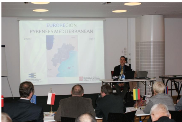
Presentation of Euroregion Pyrénées-Méditerranée (Kosta)