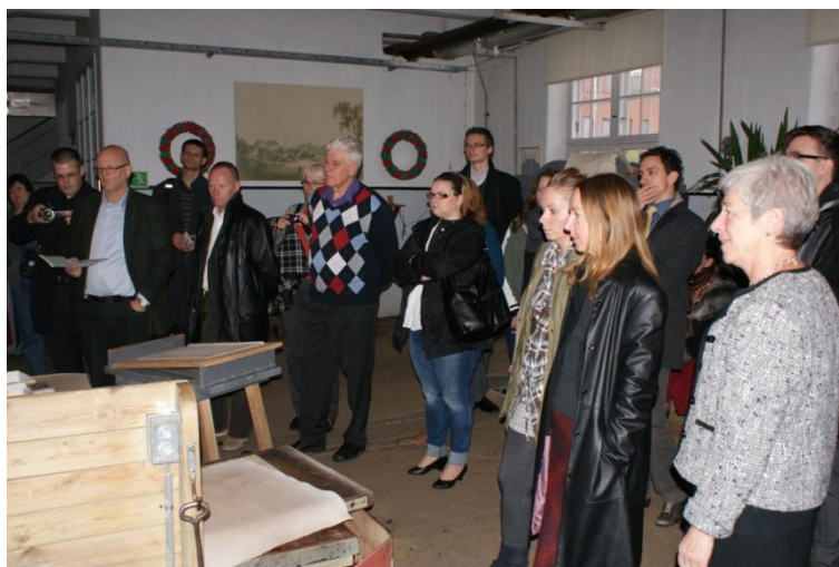
Visit to Lessebo Handpappersbruk (Hand Paper Mill in Lessebo)