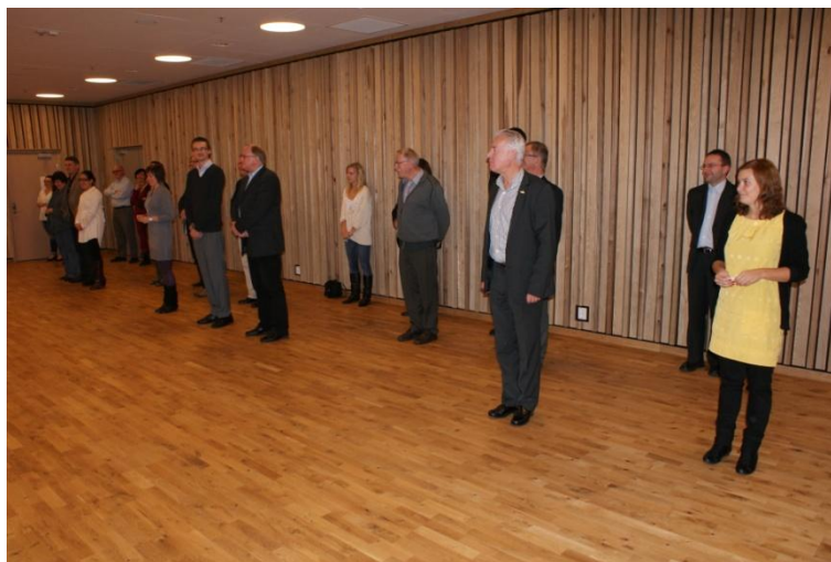
ERB Council meeting participants lined up to face youth challenge